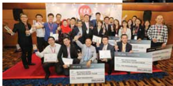
Congratulation to all award winners 恭喜所有得奖者。