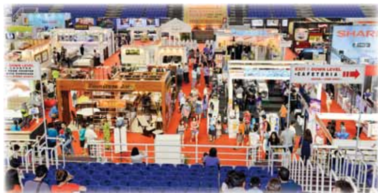
A Crowded exhibition at PENFURNEX 2016. PENFURNEX时尚家居展人潮络绎不绝。

In addition, all shoppers have the chance to participate in the lucky draws which offered attractive prizes worth RM100,000 including a new Proton Axia!