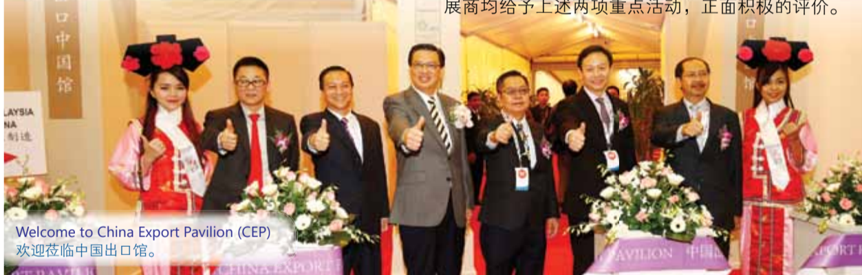
Welcome to China Export Pavilion (CEP) 欢迎莅临中国出口馆。

designers, 8 designers from the Tanggam program and 4 in-house designers. To maintain and improve Malaysia's world ranking, today the Malaysian industry is focused on the development of the culture of design, to transform its companies from "OEM" (Original Equipment Manufacturer) to "ODM" (Original Design Manufacturer) and "OBM" (Original Brand Manufacturer). Both the highlights have brought very positive feedbacks by visitors and exhibitors.