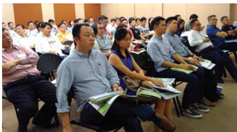
Members of KLSFEA attended the AGM. 隆雪家具企业商会会员踊跃出席今次会员大会。