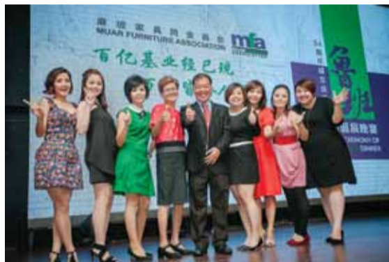
MFA staffs at the Birthday of the legendary Luban dinner. 麻坡家具同业商会职员合影。

Guests were entertained to performances by Shanghai Broadways Dance, live band and especially the lucky draw.