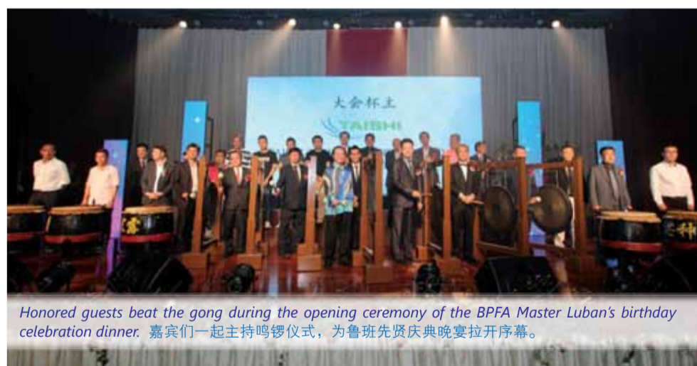
Honored guests beat the gong during the opening ceremony of the BPFA Master Luban's birthday celebration dinner. 嘉宾们一起主持鸣锣仪式，为鲁班先贤庆典晚宴拉开序幕。