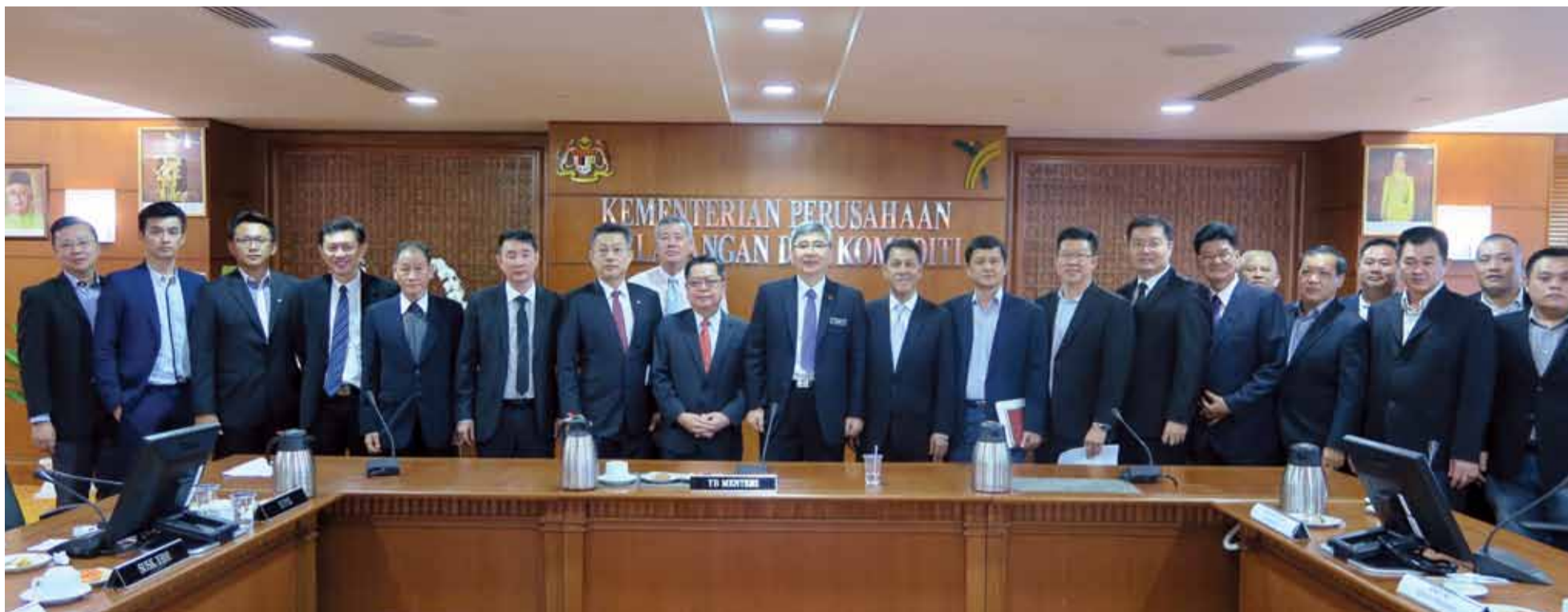
Delegation of MFC and state associations paid courtesy visit to Datuk Seri Mah Siew Keong. 总会与州属会代表团礼貌拜会新上任部长马袖强。