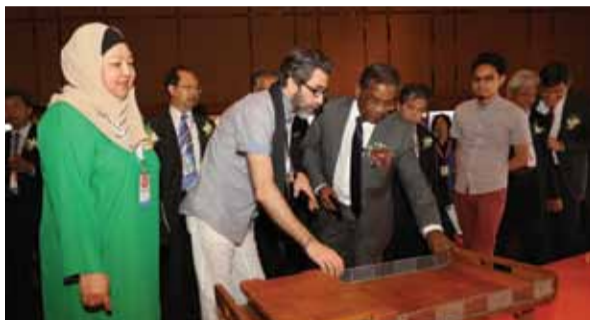
VIPs Tour of Exhibition. 贵宾们参观展位。

Among the side highlights of EFE 2016 was the China Export Pavilion (CEP) where Malaysian exhibitors were provided with an opportunity to do export to China where currently there is a strong demand of solid wood furniture products. Another highlight was the Professional Designers Programme (PDP) mooted out by Malaysian Timber Industry Board (MTIB) in collaboration with the Malaysian Furniture Promotion Council (MFPC) in their efforts in producing high-quality products with original designs. The PDP involved 4 Malaysia pride recipients manufacturers, 4 international professional