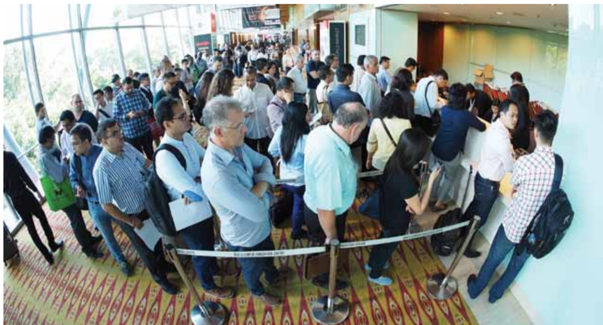
Huge Buyers registration 登记处挤满人潮。

The Export Furniture Exhibition (EFE), one of Southeast Asia's largest annual industry trade shows, returns from March 8-11 next year and exhibitors taking part will enjoy exclusive privileges for the bigger, inspiring and exciting show.