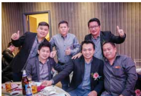
Younger leaders gathering at Muar Furniture Association's 34th Anniversary celebration and Master Luban's Birthday dinner. 家具业新生代领袖欢聚一堂。