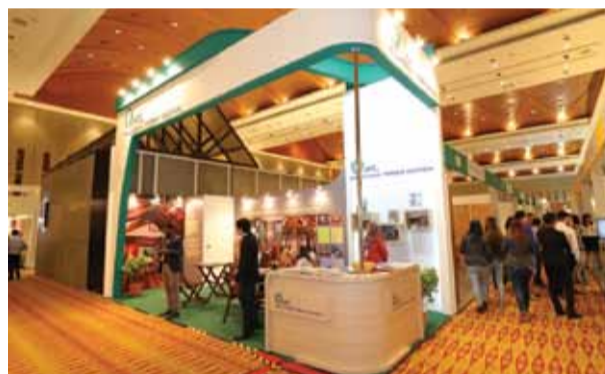
Providing Opportunities to SMEs by MTC MTC 为中小型企业提供商机。

EFE – Malaysia's premier destination for the furniture industry, is a key buying and networking event in the furniture industry. Presented by the Malaysian Furniture Council (MFC) and organized by EFE Expo Sdn Bhd, a wholly owned company of MFC, EFE is a platform of opportunities for the industry by the industry.