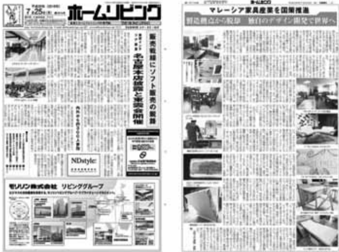
Collaboration with Home Living – Promoting Malaysian Furniture in Japan. 与Home Living杂志合作，在日本推广马来西亚家具。

With the successful visit by Furniture Today of USA in 2015 to various Malaysian furniture manufacturing companies, the Malaysian Furniture Council (MFC), has organized another similar visit by 'The Home Living'- Japan's top national trade magazine from Aik Co., Ltd. The renowned company is a member of Japan Specialized Newspaper Association, a government approved aggregate corporations formed by 90 papers representing each industry. The objective of the visit is to further promote furniture trade between Japan and Malaysia and to provide export opportunities to the Japanese market for our industry players through the media visit.