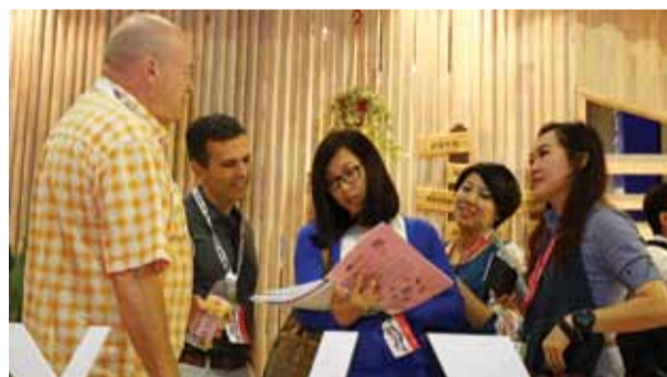
Ongoing Business Discussion 商业洽谈热络进行。