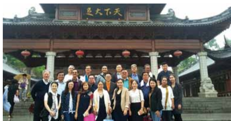
AFIC Delegates Visit the Dazu Rock Carvings. 东盟家具工业总会代表团参观重庆大足石刻时合照留影。