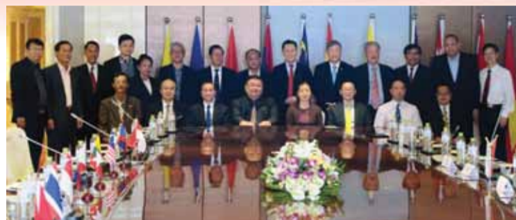
Officials and AFIC delegates at the opening of the 32nd ASEAN Furniture Industries Council Working Committee Meeting. AFIC官员及代表们出席第32次东盟家具工业总会工作委员会会议。

为了消除一周来忙碌的会议、研讨会会展览等活动的疲倦，大会也安排带团团到世界文化遗产——重庆大足石刻观光。